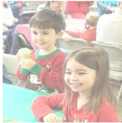
Pictures from Birthday Party for Jesus and Christmas Creches from our church family