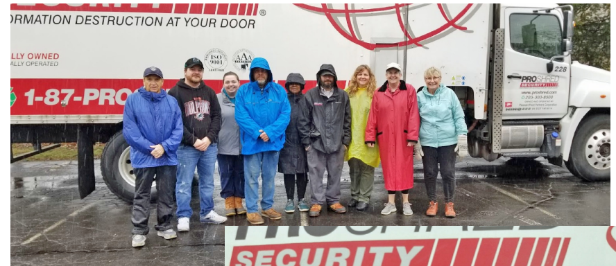
April 1, 2023