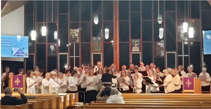
Manna Board of Directors.