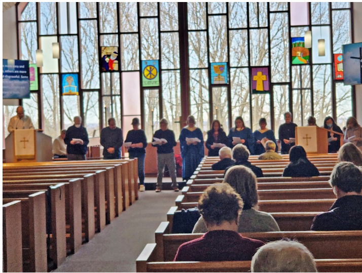
Covenant Renewal, Jan 15