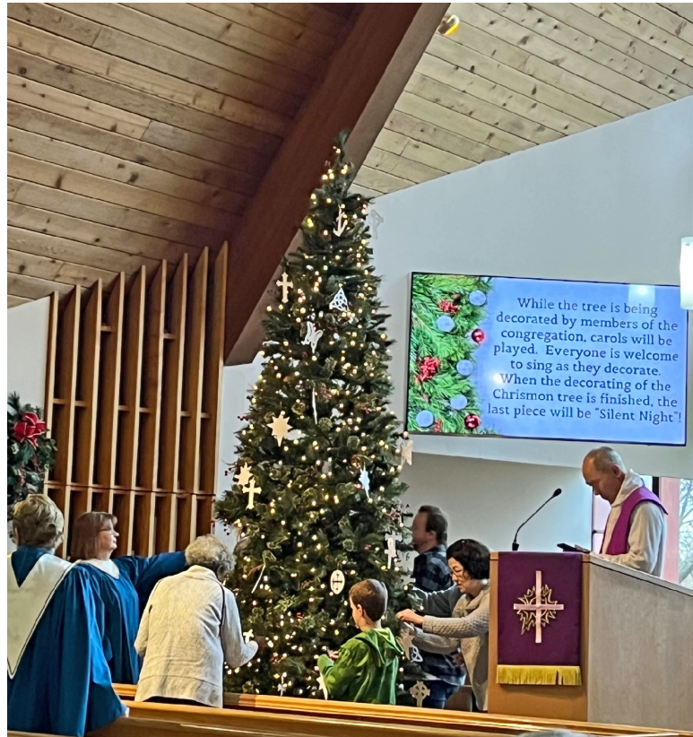
Hanging the Crismons